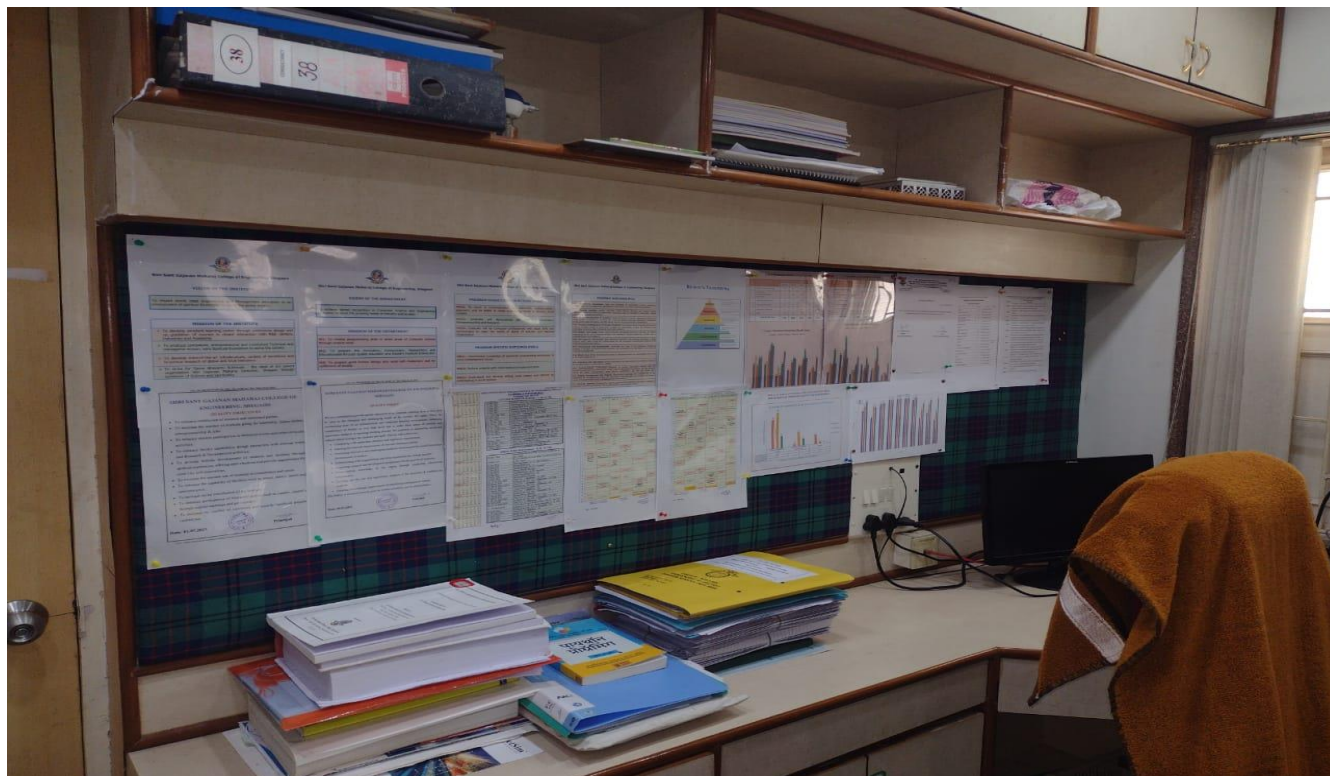
Dissemination of POs in HoD Cabin