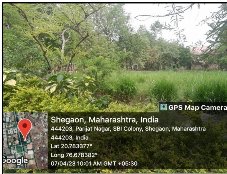
Tree Plantation in the campus

The institute has set up a dedicated nursery and greenhouse on campus, with a primary emphasis on herbal plantation. Towering trees such as Neem, Wad, Pipal, Chinch, Goolmohor, and others adorn the lush green landscape throughout the campus. Within the greenhouse and nursery, a diverse range of medicinal herbal plants are cultivated, including Brahmi, Ashwagandha, Shatawari, Aloe vera, Amla, Moringa, Tulsi, Indian Bael (Bilva), Cassia, Nilgiri, and more.