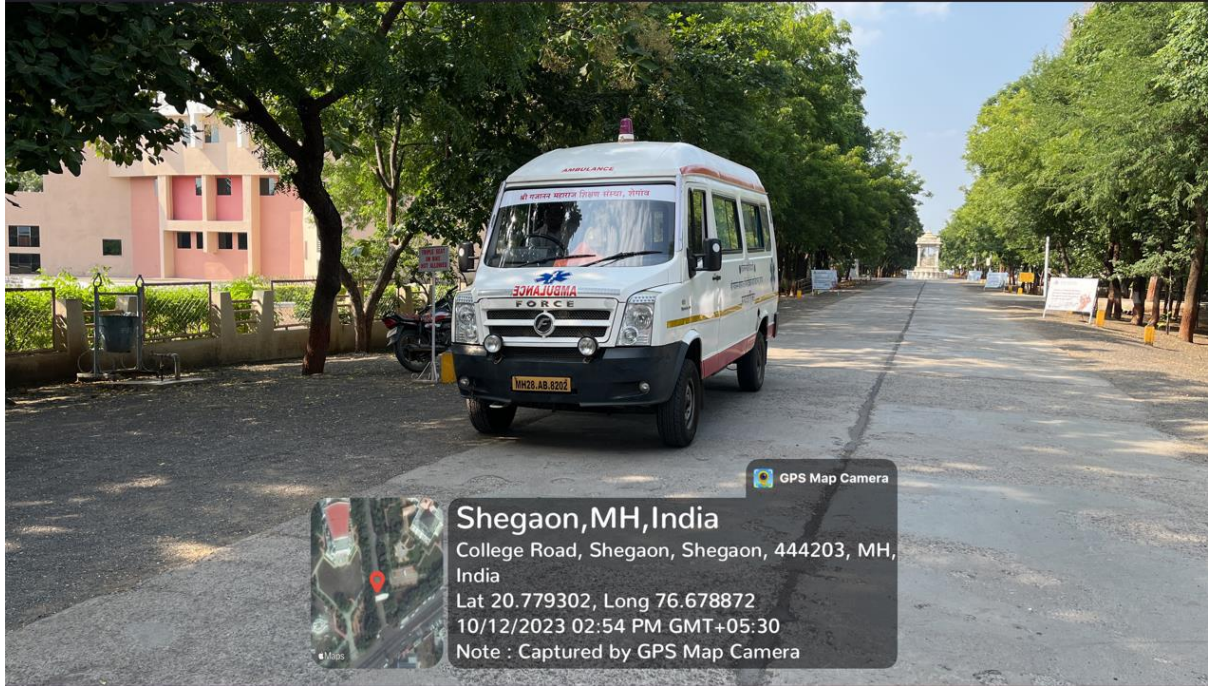
Ambulance provided for emergency services

Email. principal@ssgmce.ac.in , registrar@ssgmce.ac.in