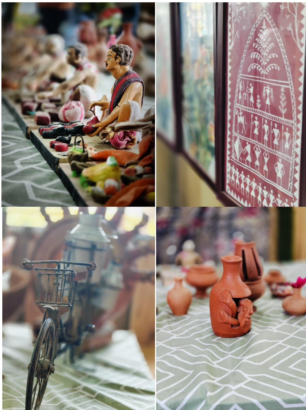
Some Creations by Specially Abled Children