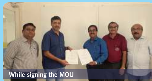
While signing the MOU

By signing MOU with TPSDI, SSGMCE has provided the platform to students to enhance their skills and grab the best of jobs in power sector. SSGMCE has always been striving for the skill development of student community. This MOU is a step ahead to achieve it. The Student community at SSGMCE Shegaon will be benefitted by this on a large scale.