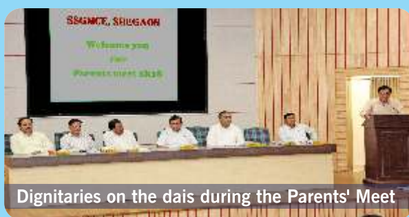
Dignitaries on the dais during the Parents' Meet