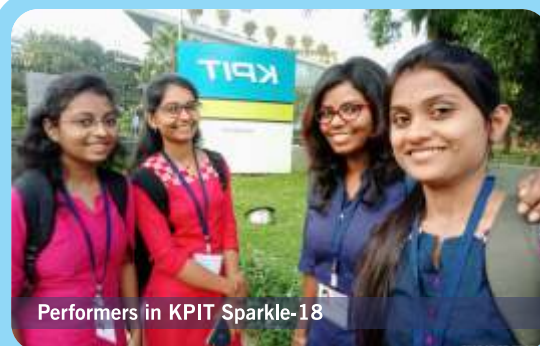
Performers in KPIT Sparkle-18

SSGMCE students won Best Philanthropy Award for the maximum students participation in Ignited Innovators of India (I2I) project competition organized by BHAU Institute at College of Engineering, Pune in April 2018. One group was Runner Up. The project title was Reader's Club-A Knowledge Hub. Every year our students participate in this competition and perform well. Their work is always innovative and aims at the betterment of society.