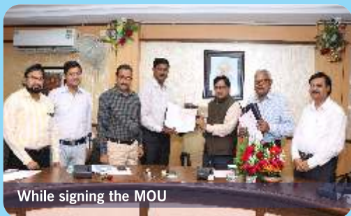
While signing the MOU