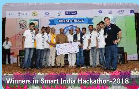
Winners in Smart India Hackathon-2018